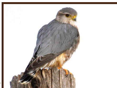
Prairie