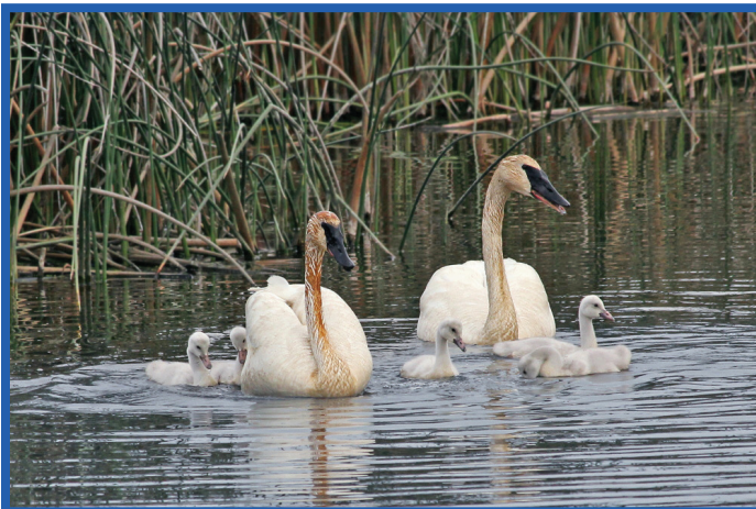
Solo and family