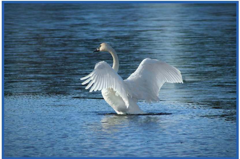
Solo