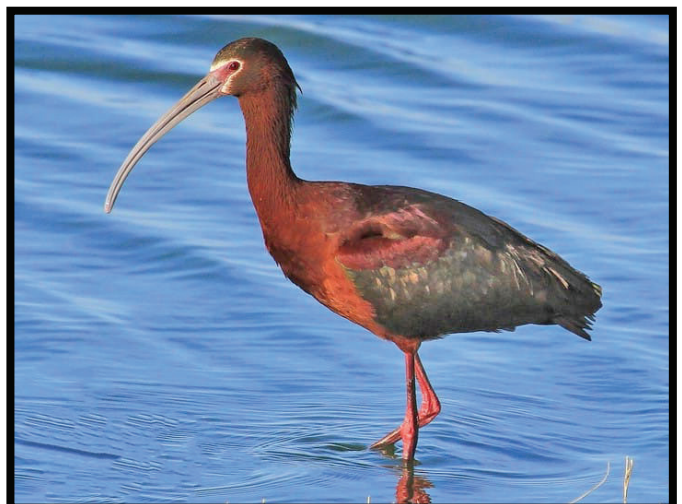
White-faced Ibis