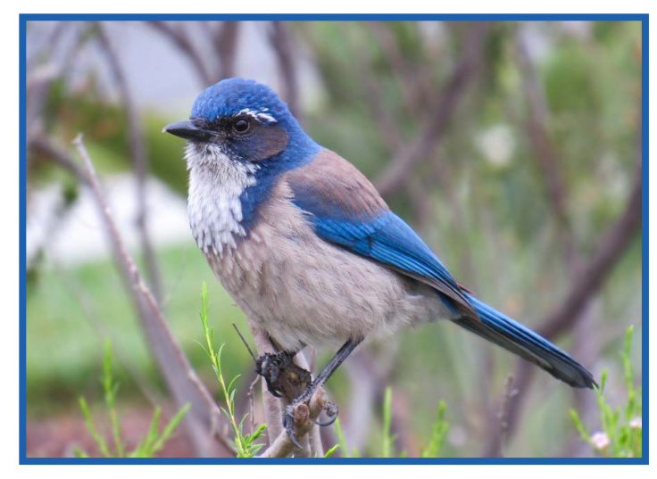
Scrub Jay

Lesser Goldfinch: Feryn Conservation Area (12/23-TL); Spokane Valley (1/12-TO)