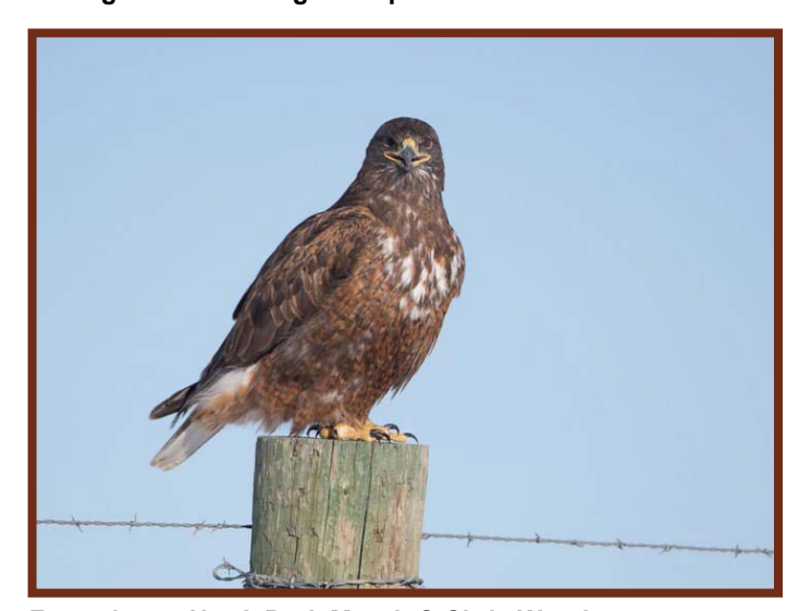
Ferruginous Hawk Dark Morph