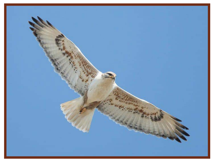
Ferruginous Hawk Light Morph

Learn more about ferruginous hawks at <u>wdfw.</u> <u>wa.gov/species-habitats/species/buteo-regalis</u> #wildlifewednesday