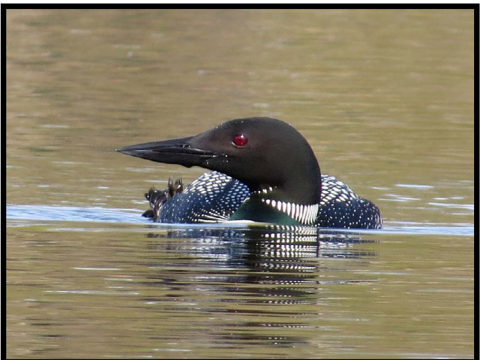
Common Loon "ABJ"

The Seney Natural History Association's activities were shut down on the Seney National Wildlife Refuge (Michigan) due to the virus for the year, but ABJ (adult banded juvenile), the oldest known banded common loon in the world, didn't get the notice! He returned to J-pool for the 24th consecutive season and successfully bred with his long-term mate, Fe, producing a healthy chick, adding to their known total of over 30 hatchlings.