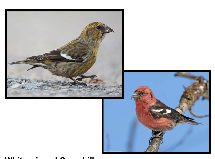
White-winged Crossbills Male - red Female - yellow © Chris Wood