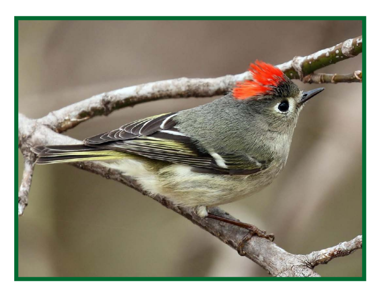
Ruby-crowned Kinglet