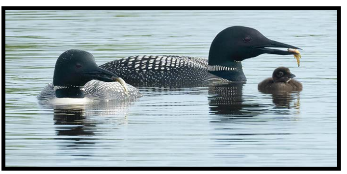
ABJ shows off his band, his mate, and their tiny chick.

It's good to know that positive things are happening for birds around the country!