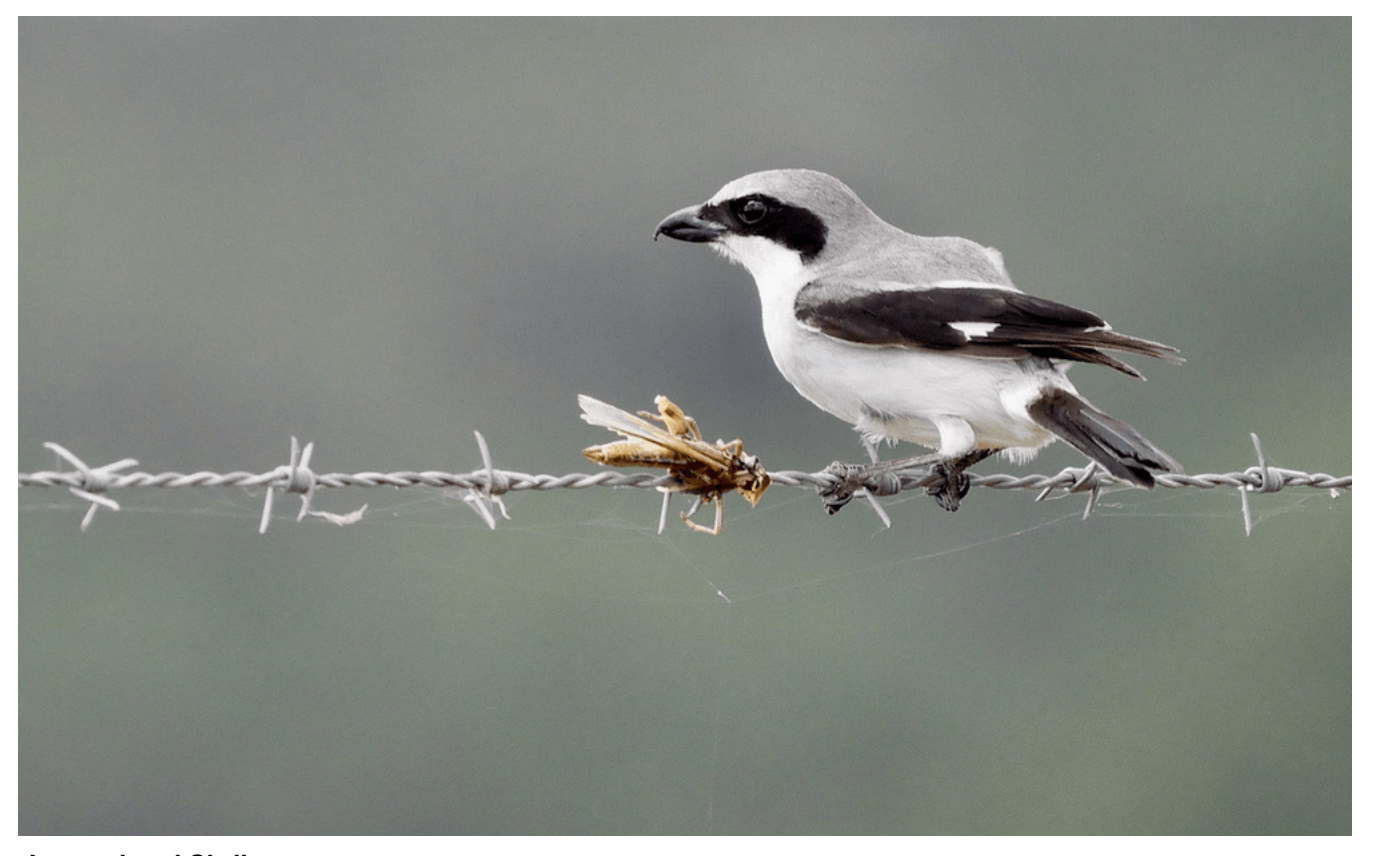
Loggerhead Shrike