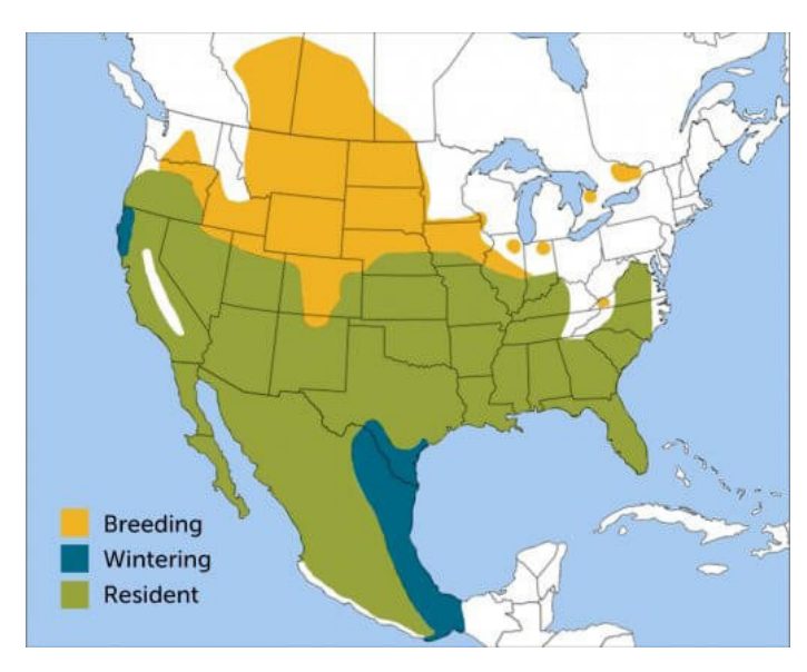
Loggerhead Shrike range map by ABC

Beginning in 1996, ABC helped convince the U.S. Navy, which was using part of San Clemente Island as a bombing range, to expand protective measures for the Loggerhead Shrike subspecies there. Thanks to this effort, along with captive breeding, predator control, and other habitat management, the subspecies is steadily recovering.