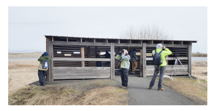
Field trip participants looking for birds near Reardan south side viewing blind.

It was good to get to know this special place all over again with this field trip series and we'll give it a try again next Spring.