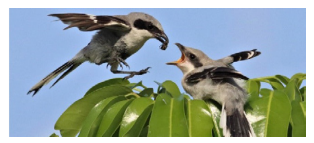
Loggerhead Shrike feeding young

Loggerhead Shrikes are territorial, and pairs aggressively defend their territory. During courtship, a male shrike performs short flight displays and brings food to the female. The pair builds a sturdy nest low in a dense, often thorny, tree or shrub. The male