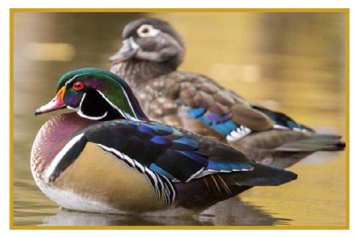
Wood Ducks

The Noels' stewardship of their Long Lake property has helped them define what they see as the most critical issue for the future of birds and birding – habitat loss and climate change.