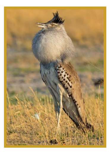
Kori Bustard

Their shared love of traveling and wildlife had them off and running to Kenya with the Peace Corps in 1975, for what turned into three and a half years of service. He taught secondary school chemistry and she taught public health at the University of Nairobi. "And we had the opportunity to see some of the most amazing wildlife in the world," she recalls. "The first time I saw a million