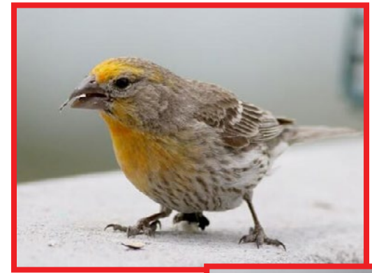
Yellow House Finch © Jay McGowan