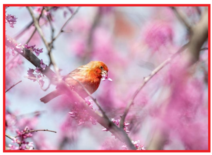
House Finch

These common and adaptable birds provide a welcome pop of color at feeders from coast to coast. But they weren't always so ubiquitous.