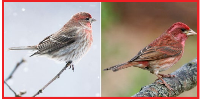
House Finch

1.) Once limited to the Western United States and Mexico, House Finches are now found from coast to coast, and as far north as southern Canada. In 1939 a few of the birds, originally captured in Santa Barbara, California, were set free on New York's Long Island by a pet store owner. By the early 1940s wild nests were beginning to show up on Long Island, and from there the spread continued. They've also been introduced and become widespread in Hawaii. In some places, House Finches are considered an invasive species. They act as a vector for disease and compete for food and territory against native birds like Purple Finches—a species they're sometimes confused with since males share reddish plumage.