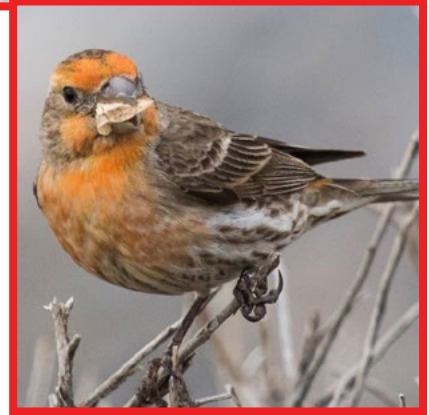
Orange House Finch