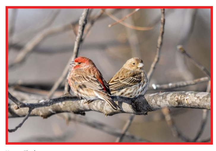
House Finch

5.) Although House Finches are well adapted to dry climates, they still need a lot of water. On especially hot days, they can consume more than their own bodyweight in fluids. Luckily, succulent plants abound in their native, arid habitat, offering a hydrating food source. Eating the fruits and flowers of cacti, such as saguaros and ocotillo, allows the finches to get enough liquids without drinking directly. Still, they love water as much as any other species, and a birdbath is likely to draw lots of them to your yard.