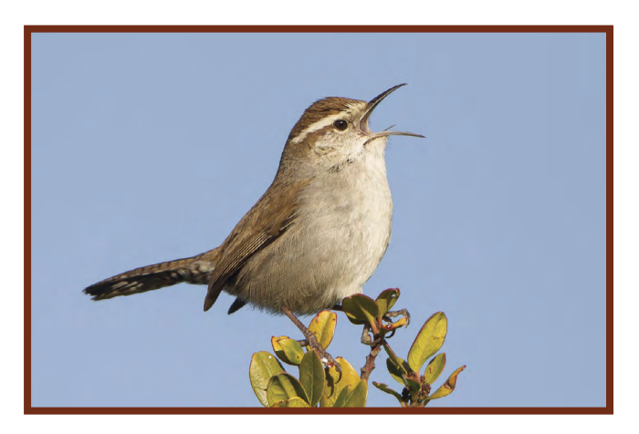
Bewick's Wren