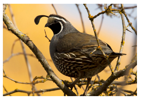
California Quail, from the 2014 calendar, by Lindell Haggin

Submission period begins May 1. See page 4 for complete guidelines.