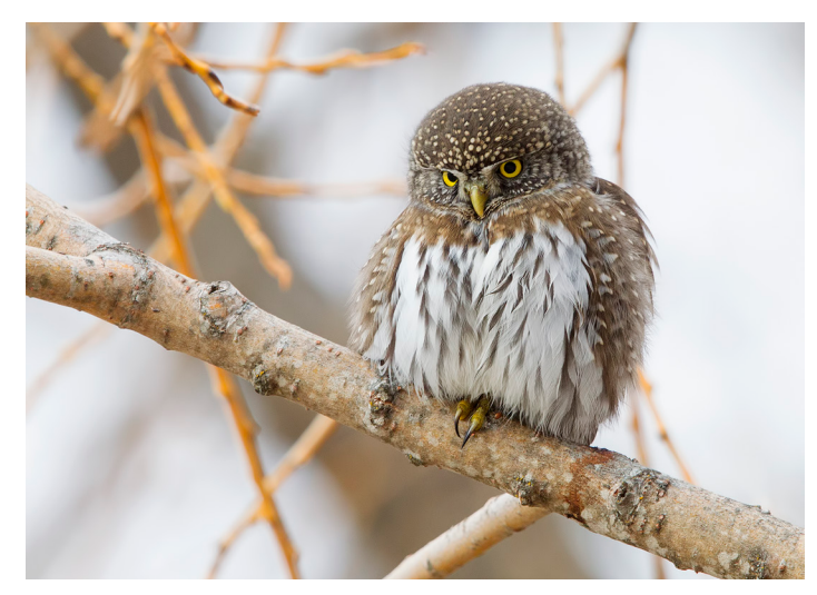
Northern Pygmy Owl, from the 2015 calendar, by Tom Munson