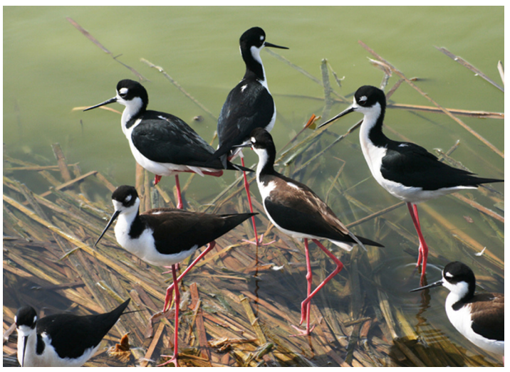
Black-necked Stilts, from the 2016 calendar, by Bea Harrison