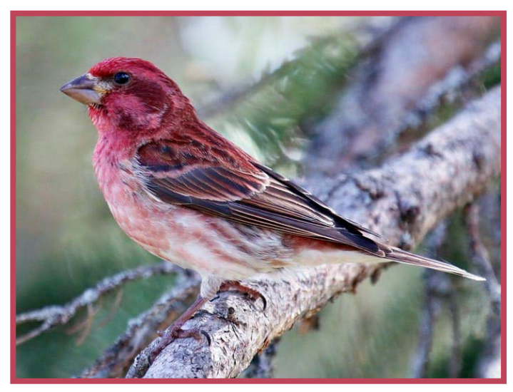
Eastern Purple Finch

White-winged Crossbill: Mt. Spokane SP (2/24-RuM)