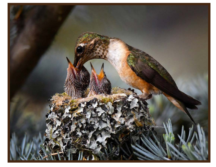
Rufous Hummingbird Babies © Sally Harris Sequim, WA