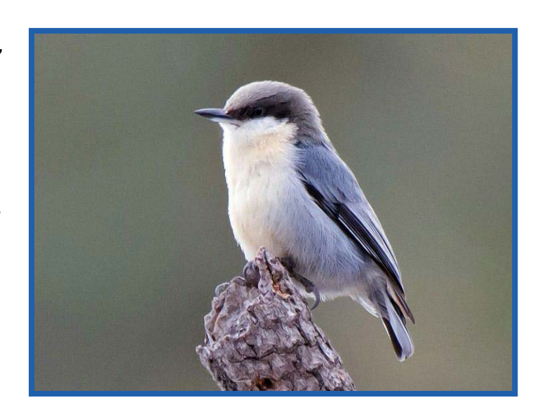
Pygmy Nuthatch (adult)

spend the time and money needed to conserve land and save critical ecosystems and species here and now. Then we'll have to look back and ask if the net reduction of atmospheric carbon was worth it if much of the world's ecosystems and the birds already become extinct because we neglected to preserve and protect land."