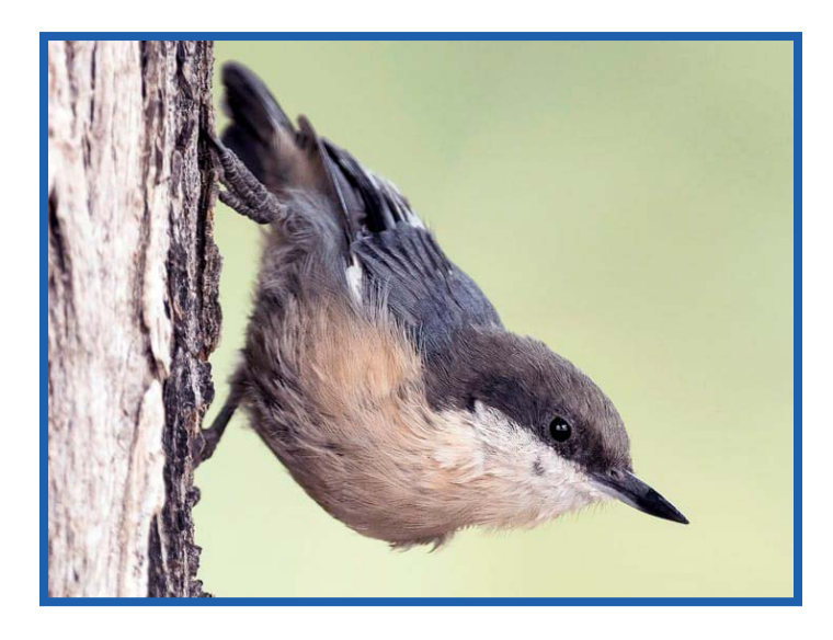
Pygmy Nuthatch (immature) © lan Routley