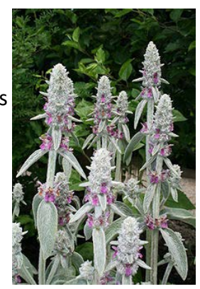
Stachys byzantina (Lamb's Ears)

plants have seed heads or pods that transform into fuzzy balls of soft fiber, or are encased in soft protective casings. Examples include clematis, honeysuckle, milkweed (Asclepias species) and blanket flower (Gaillardia species). Pasque flowers offer both soft foliage with silken hairs, and mid-spring flowers followed by fuzzy seedpods.