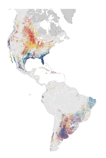
Pied-billed Grebes

It radiated a sense of pride, confidence. In Celtic mythology, the grebe guards the spirit world and helps humans find beauty where they otherwise might not. The contours of its body, the S-shape of its neck, tautness of its muscles all projected splendor. Suddenly, the grebe just sank out of sight, hardly making a ripple. No dive, it just dropped as if it were a rock gently placed on the surface. The bird must have compressed its body feathers, squeezing out the trapped air, and tightened its chest muscles to make its air sacks smaller, decreasing its buoyancy. I shook my head as I got back to my feet. Birds are so marvelous.