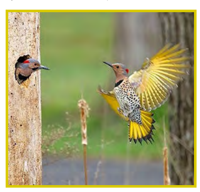
Yellow-shafted and Red-shafted Flickers