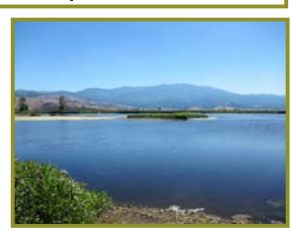
Looking southeast over Graham Pond by Nicki Feiten