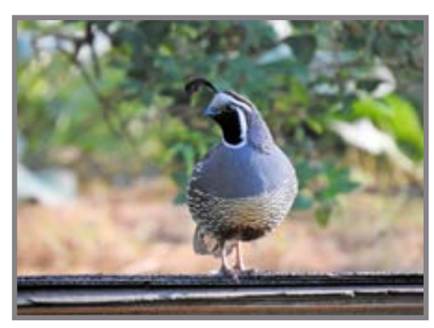
California Quail

Due to the pandemic, organized field trips are on hold until further notice