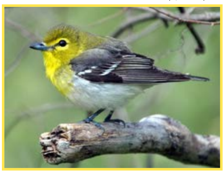
Yellow-throated Vireo

CHESTNUT-SIDED WARBLER: Washtucna (9/15-BF)