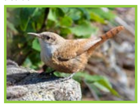
Canyon Wren

The newsletter deadline is the 20th of the month for the next month's edition.