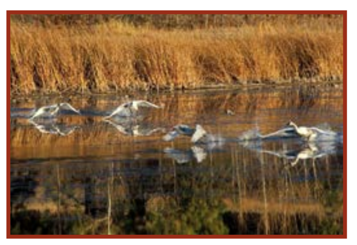
Trumpeter Swans

Explore grasslands and forest along walking trails or the 5.5-mile auto-tour route for summer sightings of California Quail, Northern Harrier, Black-chinned Hummingbird, Red-naped Sapsucker, Say's Phoebe, Eastern Kingbird, Pygmy Nuthatch, Western Bluebird, Mountain Bluebird, or Black-headed Grosbeak.